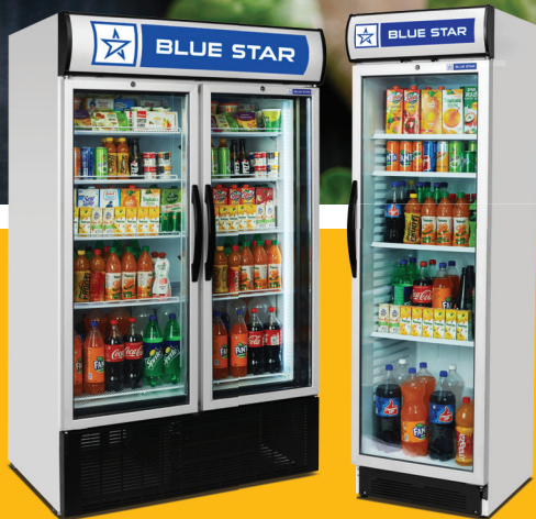
EXHIBIT YOUR PRODUCTS. ELEVATE YOUR PROFITS.

The widest range of Visi Coolers from 50L to 1250L.